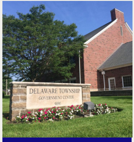
Food Pantry Needs and Statistics: pg. 2-4