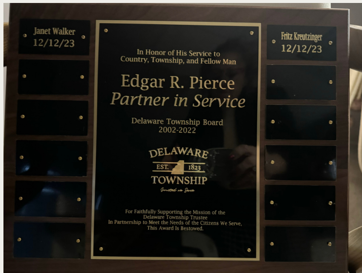
Edgar R. Pierce ‘Partner in Service’ Plaque, to be displayed In Delaware Township’s Kirkendall Room.