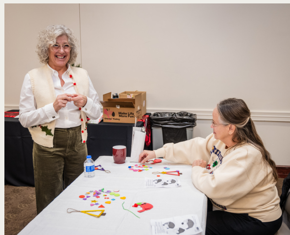
A Delaware Township volunteer and a guest working on a festive craft